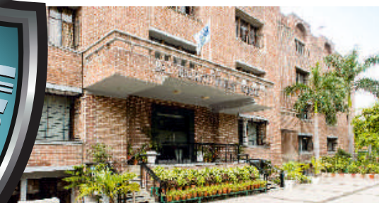
Opening Ceremony - 13 October 2023 BBPS PITAMPURA