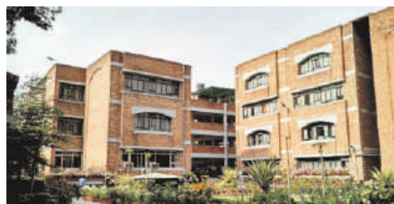
Closing Ceremony - 15 October 2023 BBPS ROHINI

The 14th All-India Inter-Unit Sports Meet, a vibrant and exhilarating celebration of sportsmanship and camaraderie, took place from 13-15 October 2023, jointly hosted by Bal Bharati Public School, Pitampura and Bal Bharati Public School, Rohini.